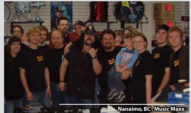
Nanaimo, BC, Music Maxx