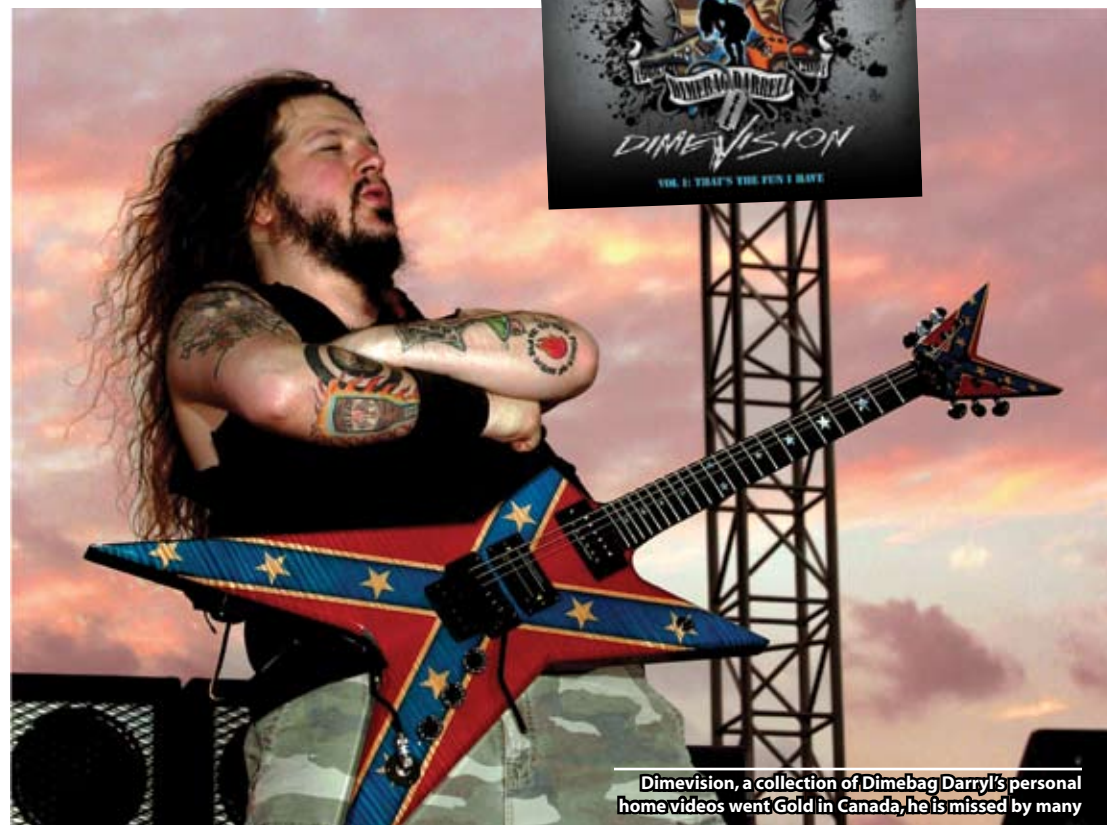
Dimevision, a collection of Dimebag Darryl's personal home videos went Gold in Canada, he is missed by many