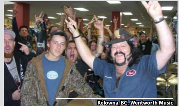
Kelowna, BC, Wentworth Music