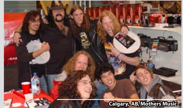
Calgary, AB, Mothers Music