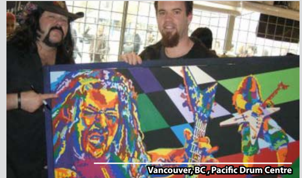
Vancouver, BC, Pacific Drum Centre