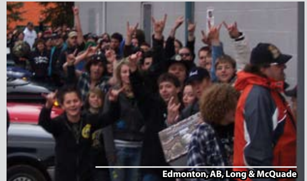
Edmonton, AB, Long & McQuade