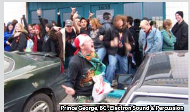
Prince George, BC, Electron Sound & Percussion